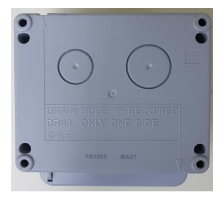
Bottom View of P8225S